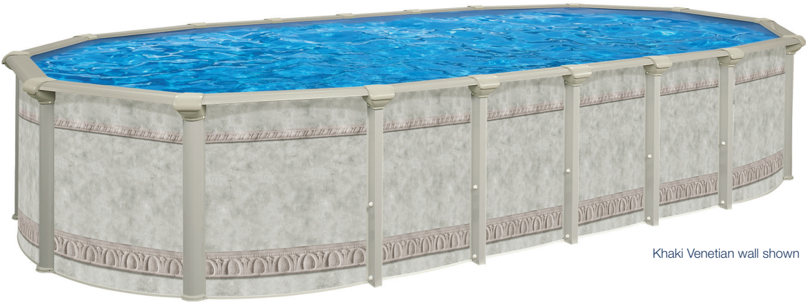
Khaki Venetian wall shown

Rounds | 52" 8' 12' 15' 18' 21' 24' 27' 30' 33'