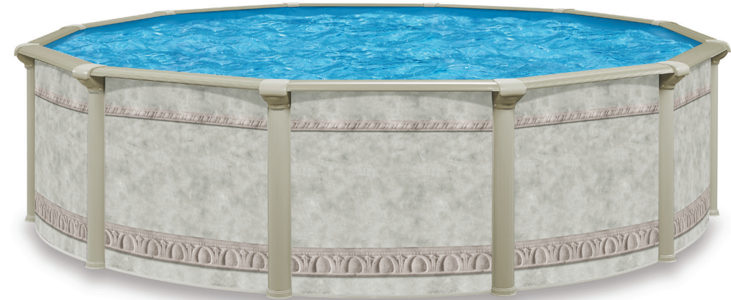
Khaki Venetian wall shown

Rounds | 52" 8' 12' 15' 18' 21' 24' 27' 30' 33'